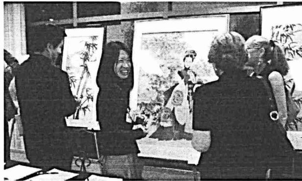
Participants viewing Sun Ying's "Peony and Empress," the highest selling piece of the silent art auction.